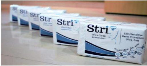
Stri Sanitary Napkins